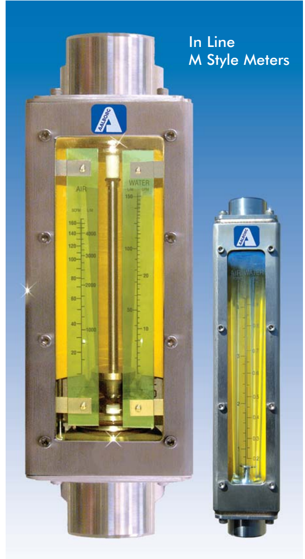
In Line M Style Meters