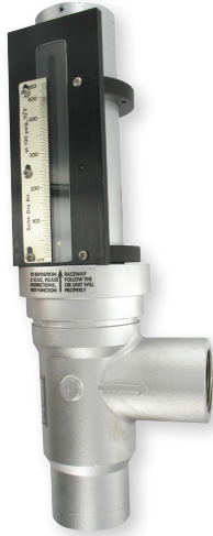
1-1/2" NPT Connection