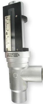
3/4" NPT Connection