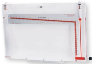
Inclined-Vertical Manometer Single Column