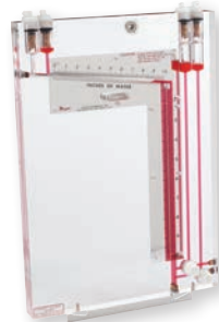
Inclined-Vertical Manometer Double Column